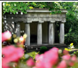
Merten Castle grounds