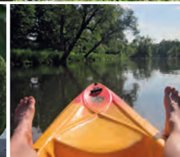
Canoeing on the Sieg