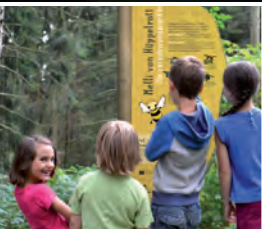
Educational bee trail