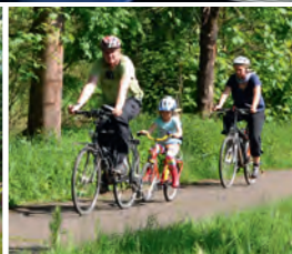
Radweg Sieg cycling path