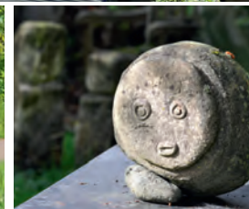
Vetere sculpture garden